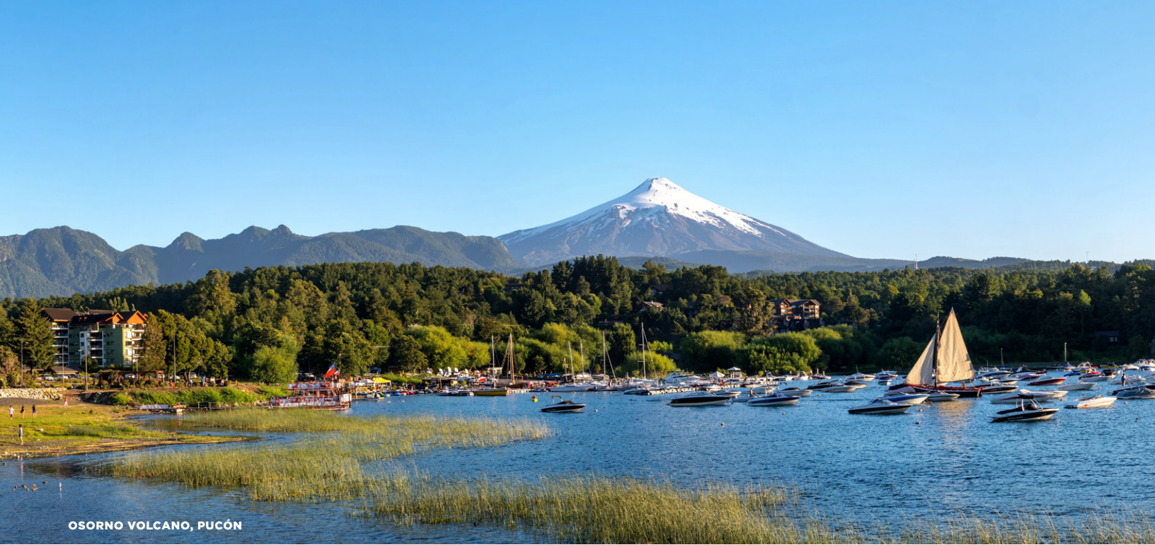
OSORNO VOLCANO, PUCÓN