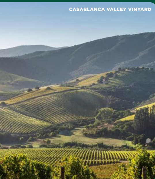
CASABLANCA VALLEY VINYARD

Arrive in the U.S. and connect to your flights home.