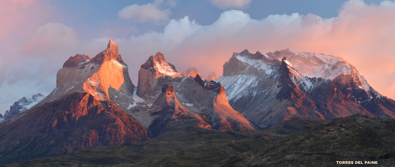
TORRES DEL PAINE