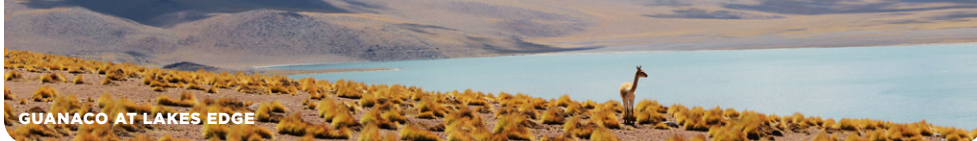
GUANACO AT LAKES EDGE

port-of-call for all ships circumnavigating the world. We'll tour some of its landmarks to provide insight into the rich history and cultural heritage in and around this unique town at world's end, including Fort Bulnes, a reconstructed fort highlighting the rigors of early 19th century colonization efforts on the strategically important Magellan Strait. We will also head south along the Strait to Port Famine—visited by Charles Darwin in 1834 aboard HMS Beagle —and pay our respects at the nearby Cementerio Inglés (English Cemetery), the final resting place of the ill-fated commander of the HMS Beagle 's first voyage. The evening is free.