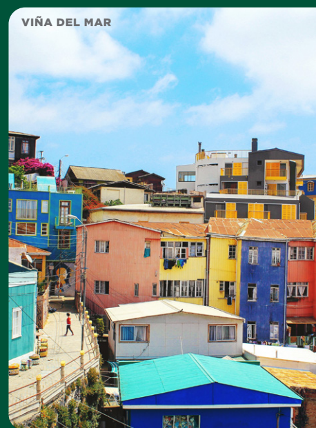
VIÑA DEL MAR

We spend an additional night in Santiago and the next day we travel to Valparaíso, a UNESCO World Heritage site and one of the first South American cities founded by the Spanish. In the morning we depart for the Pacific coast, again driving through the open coastal Casablanca Valley famous for its excellent white wines and Pinot Noirs. We tour the historic port city of Valparaíso and stroll through the Concepción and Alegre neighborhoods and ride the century-old hillside ascensors (elevators). We will also visit Viña del Mar, a seaside resort town near Valparaíso known for its beautiful gardens, beaches, and tall buildings. We'll enjoy lunch at a restaurant with views of the ocean. We return to Santiago and transfer to the airport for our evening return flight to the U.S. PULLMAN EL BOSQUE HOTEL (B, L) • RATES FOR THE EXTENSION ARE BASED ON A MINIMUM OF 10 GUESTS.